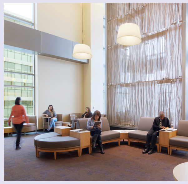
Interior of the UCSF Bakar Cancer Hospital

has performed more than 1,000 of these procedures. TSSM preserves the entire skin envelope, including the nipple-areola complex. It dramatically improves cosmetic appearance and patient satisfaction while providing similar safety outcomes to standard mastectomy, including surgeries performed prophylactically for patients with inherited risk. "We figured out how to remove all the tissue that carries risk, while leaving the skin and outside appearance intact," said Esserman.