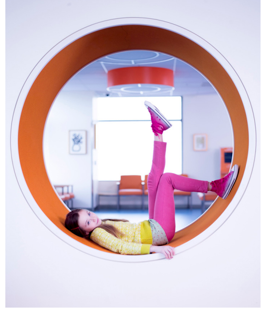
Spaces throughout the children's hospital were built with kids in mind

"We are also actively growing all of our pediatric surgical programs, including